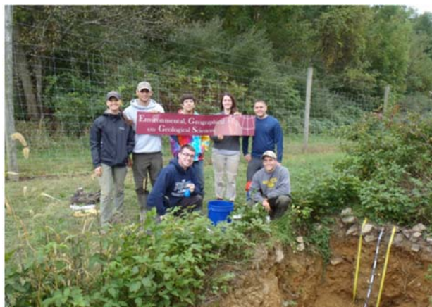
2016 Bloomsburg Soil Judging Team