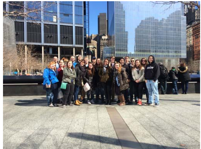
Spring 2016 - EGGS 390 Field Trip to 9/11 Memorial and Museum

Faculty advisor, Colleges Against Cancer - Bloomsburg University Chapter