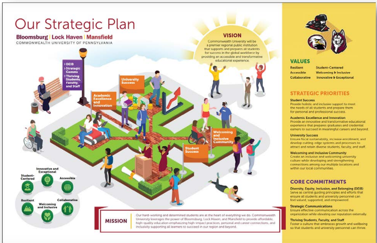
Figure 2: CU Strategic Plan Framework (Placement Format)

Below are the elements of the CU Strategic Plan Framework, including the mission, vision, values, core commitments, and priorities. The Strategic Plan posits three core commitments and four priority areas with supporting initiatives and metrics. The Strategic Plan Framework (see Figure 2 followed by the statements in text) serves as the foundation for institutional effectiveness as CU implements the five-year plan, aligns divisional and unit planning, and assesses progress toward realizing its mission and priorities.