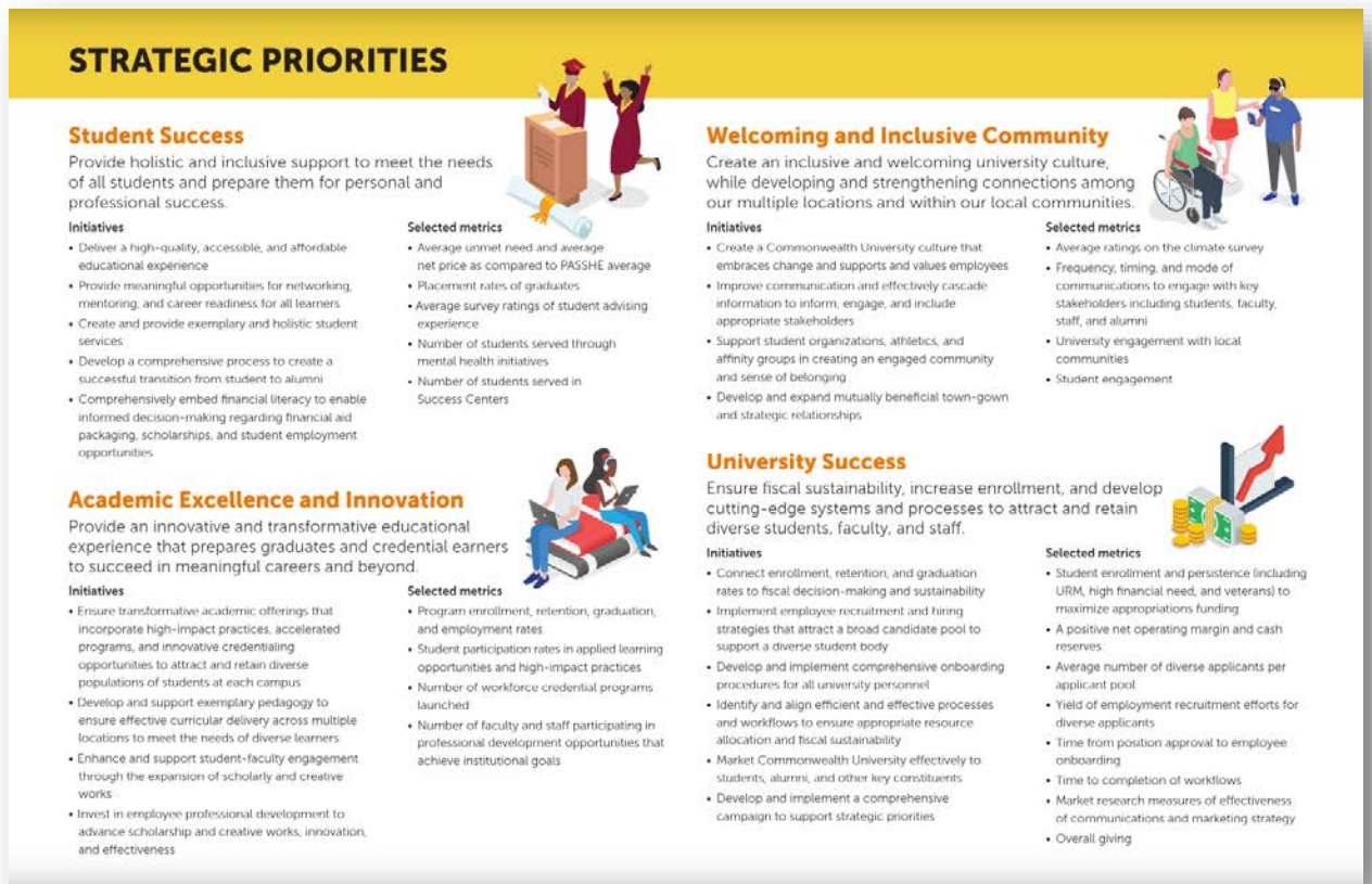
Figure 4: Strategic Priorities, Goals, Initiatives and Selected Metrics