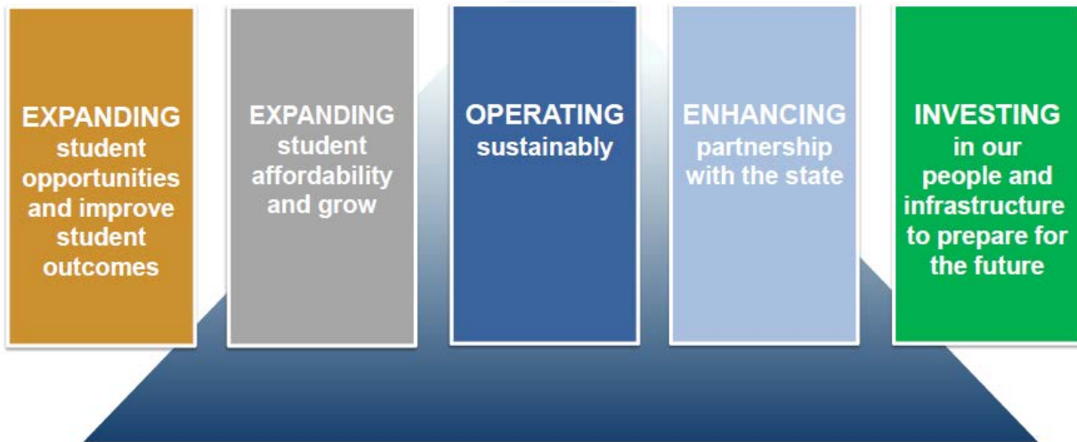
Figure 1: State System 2022-25 Priorities

As one of the 10 State System institutions, CU aligned its mission and priorities with the State System’s mission and priorities. The CU Strategic Planning process intentionally incorporated the System’s purpose as outlined in Act 188, its strategic statements, and the 2022-25 System priorities shown in Figure 1. Each year, CU conducts a comparative analysis of the System’s priorities and objectives to ensure appropriate alignment.